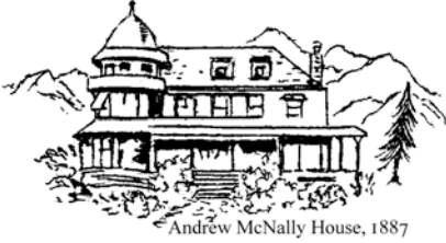
Andrew McNally House, 1887