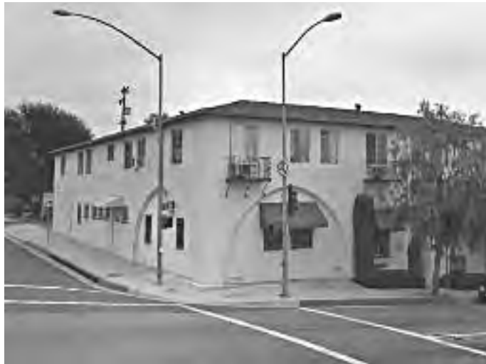
The old garage is now the Theosophical Library on the corner of Marcheta and Lake Avenue.