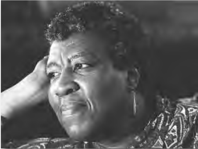
Author Octavia Estelle Butler

from a love of reading, deciding to make writing her life's work when she was 10.