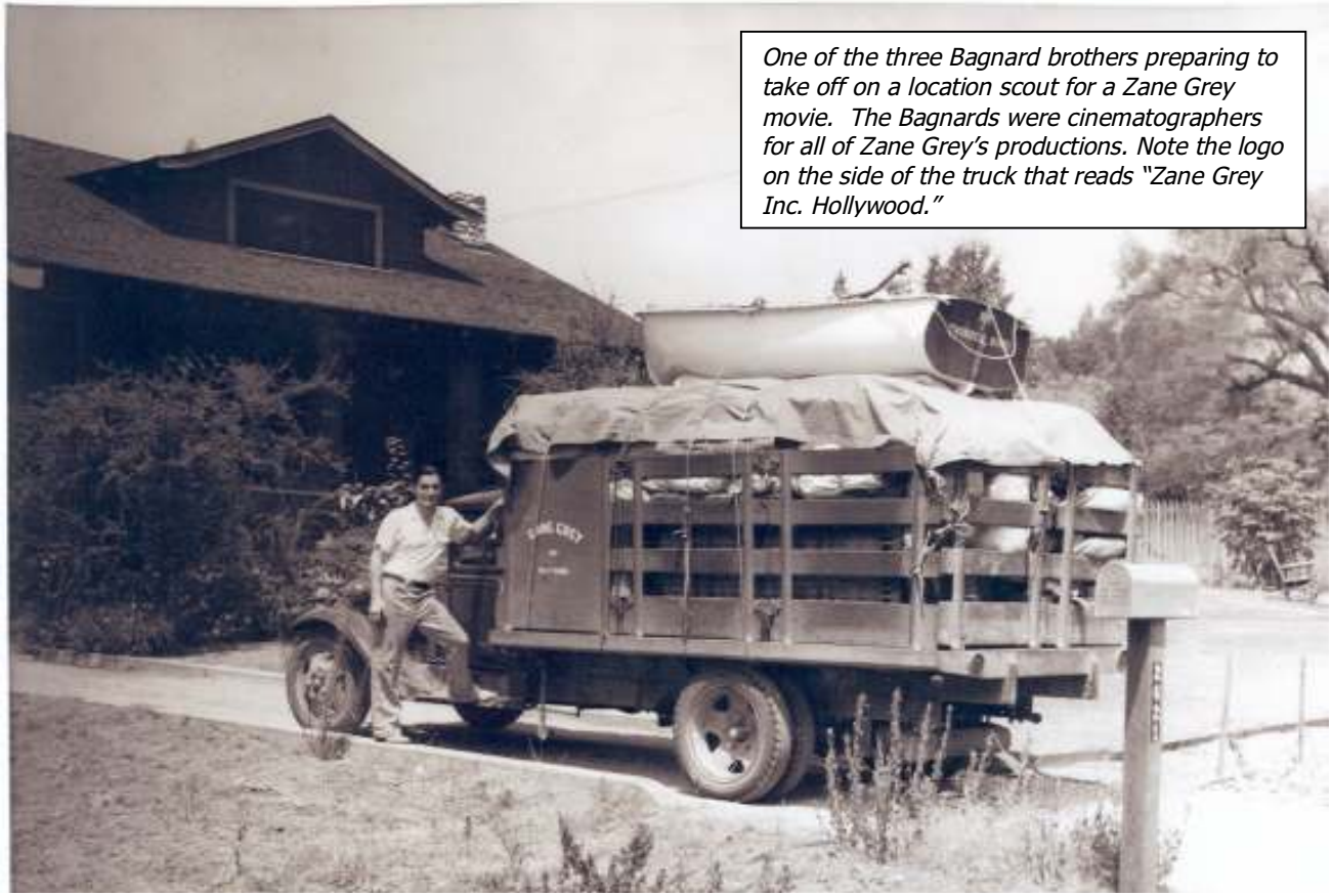
One of the three Bagnard brothers preparing to take off on a location scout for a Zane Grey movie. The Bagnards were cinematographers for all of Zane Grey's productions. Note the logo on the side of the truck that reads "Zane Grey Inc. Hollywood."