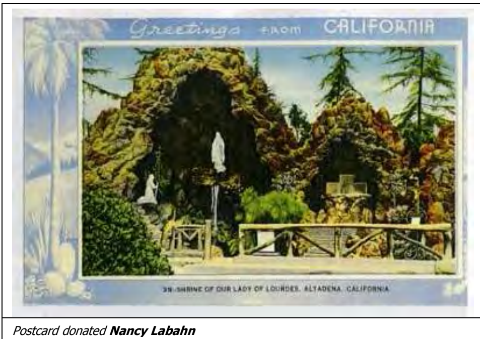
Postcard donated Nancy Labahn

On the first Sunday in October 1939, thousands of people (5,000 according to the Pasadena Star News and 10,000 according to the archdiocesan newspaper The Tidings ) marched in procession from the school on Woodbury, down Fiske Street, across Atchison and up Lake Street entering the Grotto through the wrought iron gates of Our Lady of Lourdes Grotto. Within a year 500,000 devotees and tourists made pilgrimage to the holy place.