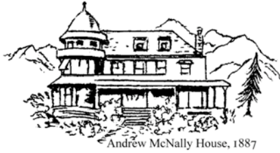
Andrew McNally House, 1887